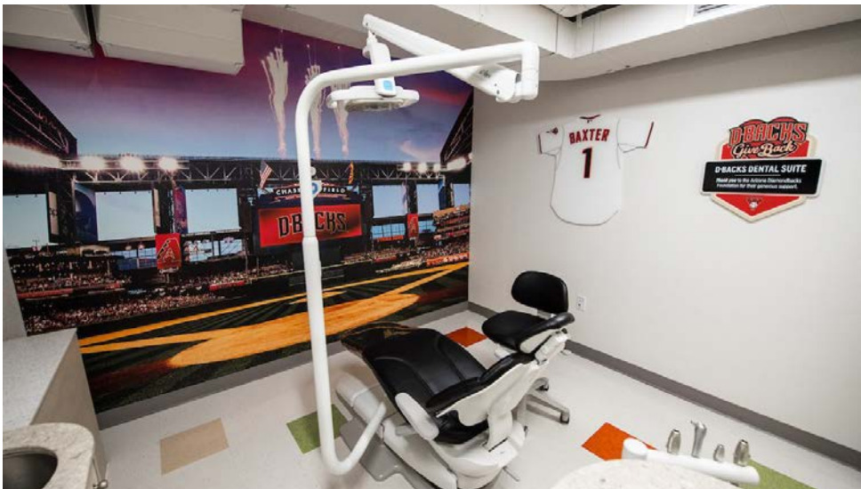
Photo inside the new dental suite inside the Gilbert Heritage Center.

As we look to the future, we aim to make an even bigger impact. With the Grand Slam funds, we have installed additional dental chairs, enabling us to add an additional day of service per week and provide nearly 1,150 children with two dental appointments each year. We believe every child deserves a healthy smile. Thank you to our friends at the Arizona Diamondbacks Foundation, and many other supporters, for helping us bring more smiles to Gilbert's children.