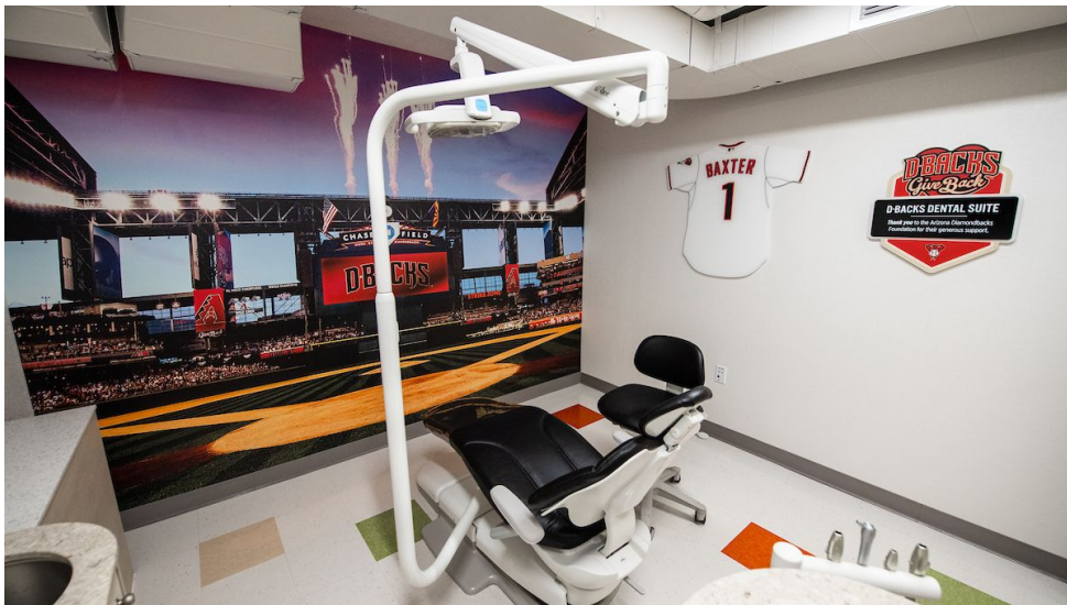
Photo inside the new dental suite inside the Gilbert Heritage Center.

As we look to the future, we aim to make an even bigger impact. With the Grand Slam funds, we have installed additional dental chairs, enabling us to add an additional day of service per week and provide nearly 1,150 children with two dental appointments each year. We believe every child deserves a healthy smile. Thank you to our friends at the Arizona Diamondbacks Foundation, and many other supporters, for helping us bring more smiles to Gilbert's children.